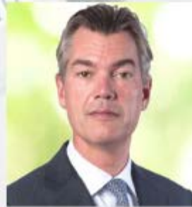
Jan Dop Russell Advocaten B.V.